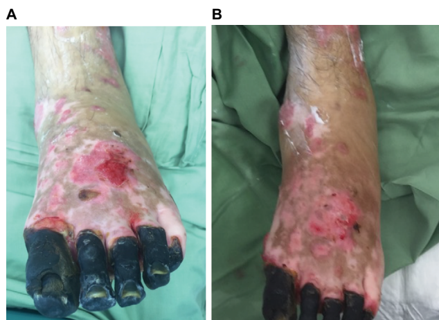
Figure 3 Case 1.

Notes: (A) Hypergranulation tissue to the left dorsum prior to treatment with topical hydrocortisone; (B) 3 weeks after treatment regime with topical hydrocortisone acetate 0.25% solution.