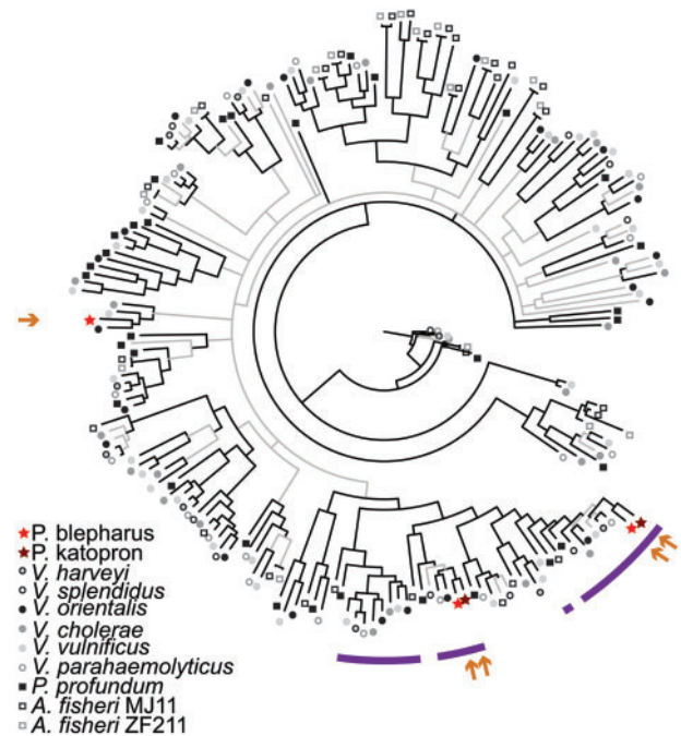
Fig. 3. —Bayesian tree based on amino acid sequences for all MCP genes found in anomalopid symbionts and the free-living relatives V. harveyi 1DA3, V. splendidus ATCC 33789, V. orientalis CIP102891, V. cholerae O395, V. vulnificus CMCP6, V. parahaemolyticus RIMD 2210633, P. profundum SS9, A. fisheri MJ11, and A. fisheri ZF211. Genes with >40% sequence identity to anomalopid MCP genes, over 40% of the gene length, were included. Branches shown in black have \geq 95\% posterior probability and branches with less support are in gray. Arrows indicate location of anomalopid symbiont sequences and purple bars denote conserved amino acid ligand binding sequence, suggesting that they may respond to amino acids in the environment (Taguchi et al. 1997; Glekas et al. 2010; Nishiyama et al. 2012; Brennan et al. 2013).

With the exception of the reduction in copy number for MCP genes, both anomalopid symbiont genomes have retained the full complement of chemotaxis and motility genes found in some free-living relatives (Hendry et al. 2014), including all genes necessary for flagellum synthesis and function and all chemotaxis genes necessary for signal transduction from MCPs to the flagella ( cheW , cheA , cheY ,