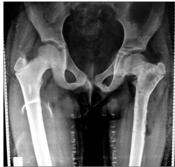
Fig. 3. The X-ray shows no recurrence of deformity after plate removal at 36 months follow-up.

The angle of correction was determined by tracing paper on the plain AP radiographs of the pelvis taken with both hips in neutral rotation. The surgery was performed using the straight lateral approach to the proximal femur. The T-shaped plate (Synthesis plate and screw; Tantawi Medical Co., Cairo, Egypt) was contoured to the desired angle of correction. After removal of a triangular wedge, the osteotomy was closed. The most proximal screw was tightened and the second screw in the femoral neck was inserted. The distal fragment was secured to the plate by at least four screws starting by the proximal oblique screw in the oval hole just below the planned osteotomy site to allow compression at the osteotomy site. Wound was closed in a usual manner and drain was removed 48 hours after sur-