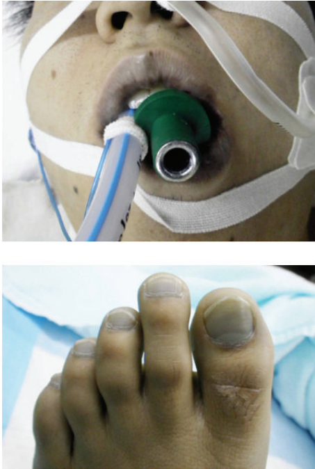
FIGURE 1: His face, lips, and toes were deeply cyanosed on admission.