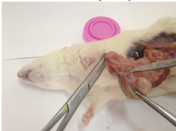
Fig. 1. Third-degree intra-abdominal adhesion in a rat receiving normal saline (control group). Note the intraperitoneal adhesion between the colon and the mesothelium of small intestine. Three thin adhesion bands between the two tissues with no vessels are seen which cannot be easily separated.

Intestinal adhesion after laparotomy is the most