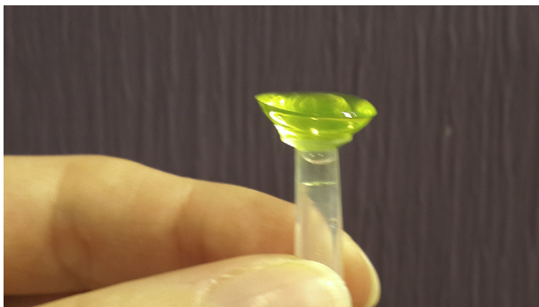
Fig. 2. Hybrid lens over the plunger and filled with fluorescein.

ophthalmologists to receive contact lenses. The descriptive statistics of the study patients is shown in Table 3.