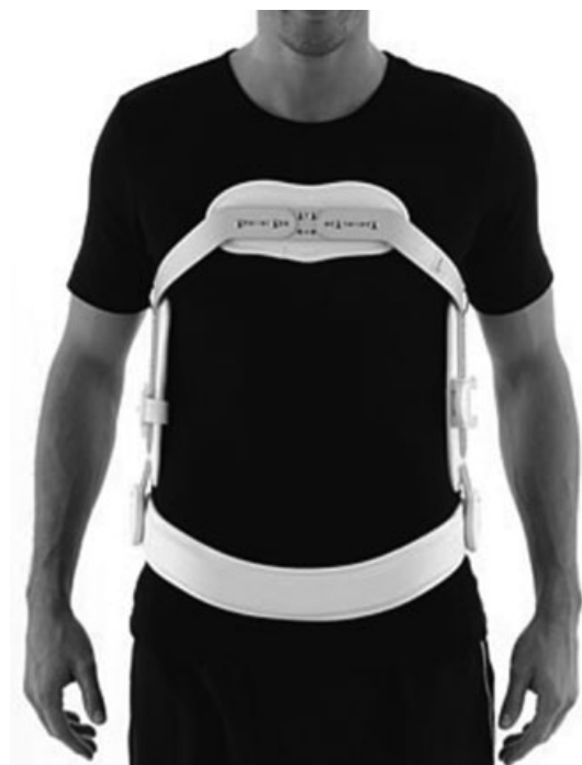
Fig. 4 Jewett brace. (Reproduced with permission, from Ossur UK Ltd.)

Adaptations to this technique have been made for patients with low bone density or dysplastic lamina. Morscher et al described using hook screw fixation to correct spondylolysis defects 19 ; however, this technique has been described as technically difficult. 20 The technique involves bone grafts to