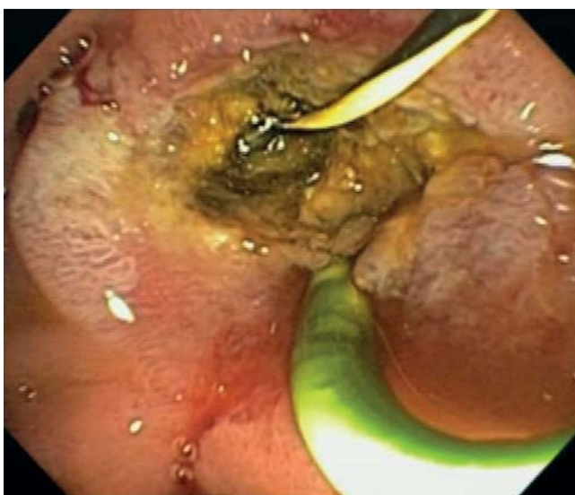
Fig. 3 Endoscopic view of the papilla after ampullectomy and intraductal radiofrequency ablation.