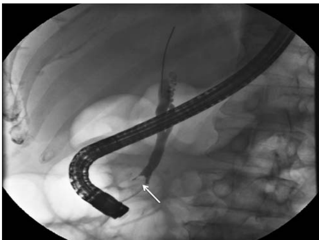
Fig. 1 Cholangiogram showing a filling defect in the distal bile duct (arrow) representing bulky intraductal extension of an ampullary adenoma.