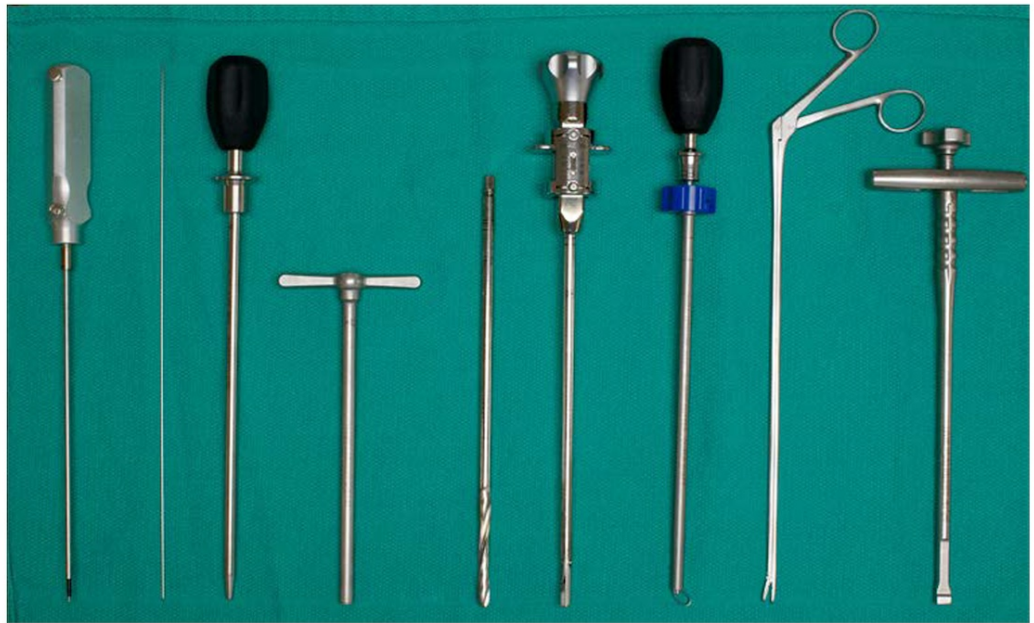
FIGURE 4: Instrumentation used for MIS-DTIF

phosphate (TCP, Berkeley Advanced Biomaterials Inc., Berkeley, CA) that had been soaked in autologous bone marrow aspirate drawn through a Jamshidi® needle (BD, New Jersey, USA) from one of the pedicles above the interested level [20]. The K-wire was once again placed in through the working tube and the tube was removed. Next, the cone-shaped PEEK Zeus-O cage was inserted over the K-wire and guided through the pleural space using biplanar fluoroscopic imaging. Once the cage was positioned on the top of the disc, it was entered into the disk space with mallet taps until one-third of the cage was past the midline. At this point, the insertion device was removed and the pleural space was sutured in two layers. The discectomy and cage placement in the lateral fluoroscopic view are in Figure 3, panels 3-6.