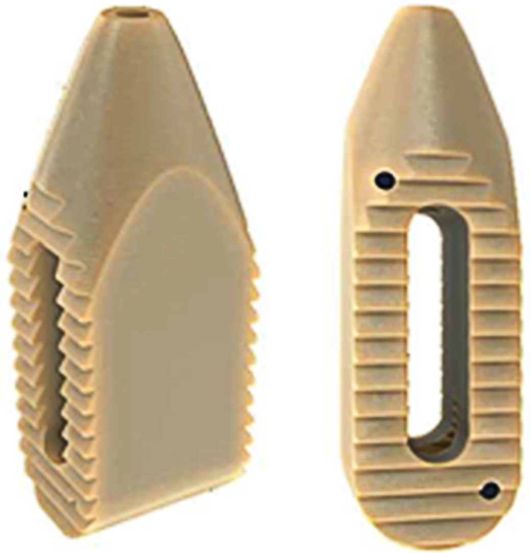
FIGURE 1: PEEK Zeus-O cage with bullet-nosed tip

For the setup of the bilateral fluoroscopy, it is important that the endplates of the target level line up well in the lateral view and the ribs are exactly leveled. In the anterior-posterior (AP) view, the disk needs to be visible and the spinous process should be centered between the pedicles. Electrophysiological monitoring was set up on the major muscle groups and the skull to monitor somatosensory evoked potentials, electromyogram, and transcranial motor evoked potentials throughout the surgery.