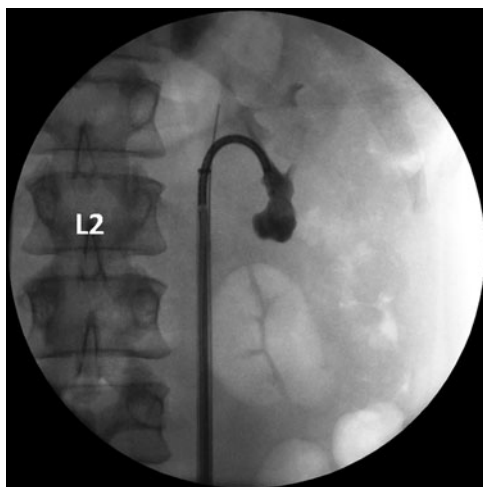
FIG. 3. LithoVue with deflection into the lower pole of the left kidney.