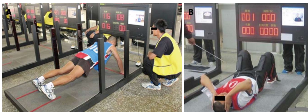
Figure 2 Illustrations of standardized procedure for push-up and sit-up tests in the cardiorespiratory fitness and hospitalization events in armed forces study, respectively. A: A participant prepared for the push-up test surrounded by four flared sensors and a computerized monitor was ahead of him. A supervisor squatted aside by him to watch for all his procedure; B: A participant prepared for the sit-up test with two touch sensors were bound on both thighs and a computerized monitor was opposite to him. A supervisor stood aside by him to watch for all his procedure.

and mortality respectively. Hospitalization events will be identified in the National Insurance Research Database and followed up for at least 10 years. This study was approved by the Institutional Review Board of the Mennonite Christian Hospital in Hualien, Taiwan and written informed consent was obtained from all participants.