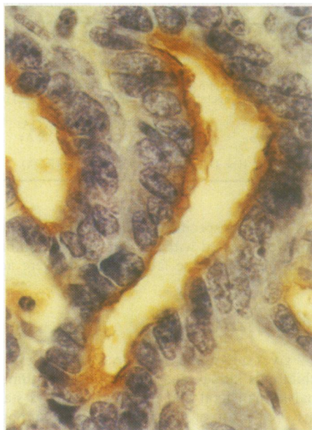
Fig. 2 Tubular Wilms' tumour with wheat germ lectin (WGA): tubular lumen is strongly stained.