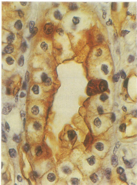
Fig. 1 Fetal kidney with horse gram lectin (DBA): note some of cells lining collecting duct are stained much more intensely than cells in their neighbourhood.