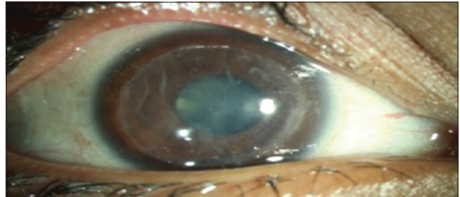
Figure 2. Post-operative day one after superficial anterior lamellar keratoplasty (SALK).