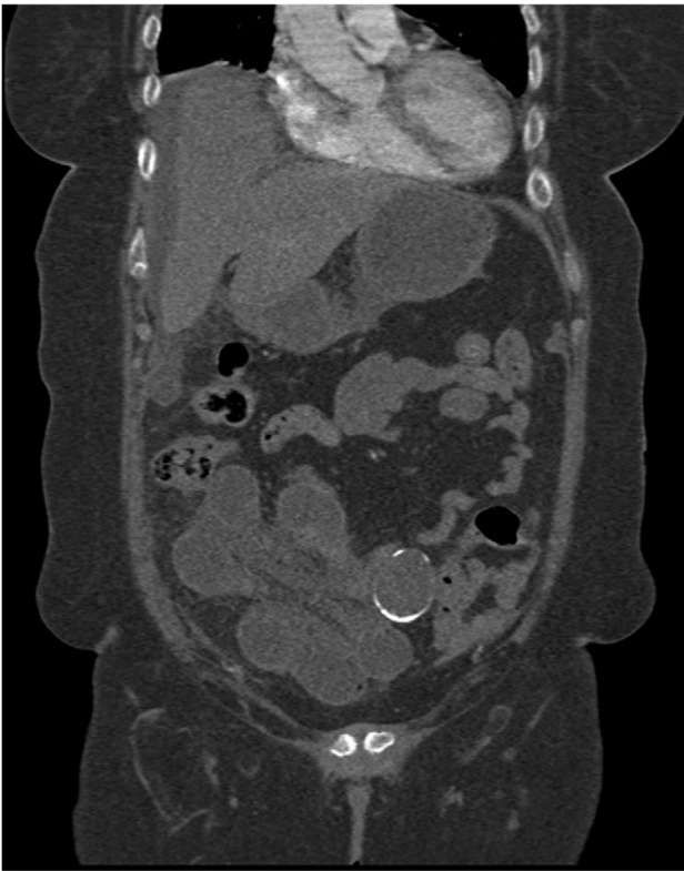
Figure 2: Coronal CT scan showing a partially calcified structure adjacent to loops of small bowel.

neurovascular bundles (Fig. 4). The patient made a good recovery and was discharged home.