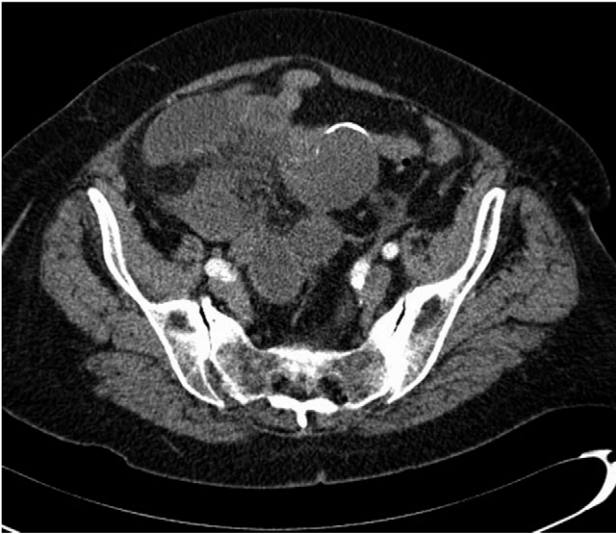
Figure 1: Axial CT scan showing a partially calcified structure adjacent to loops of small bowel.