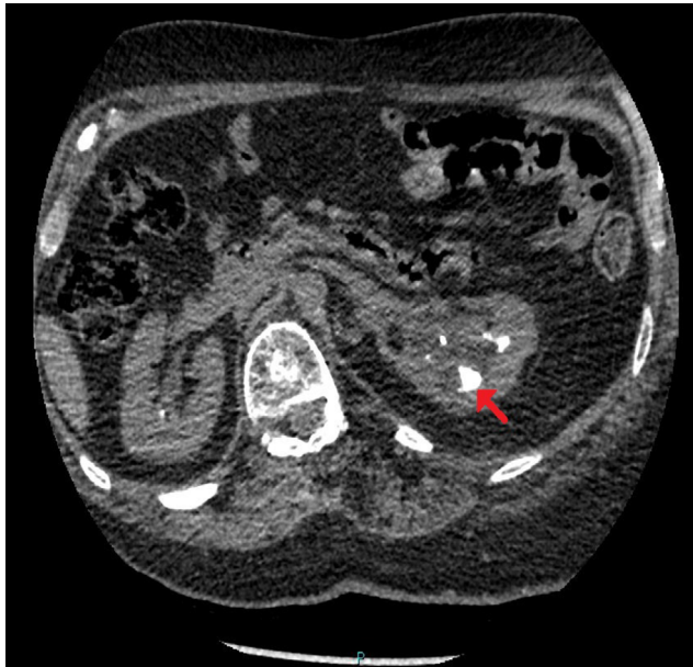
Figure 1 CT of urinary tract.

Note: Performed 3 weeks after the second ureteroscopy, axial section: residual stones in individual calyces, two of them quite large, the largest measuring ~19 mm in diameter (arrow).