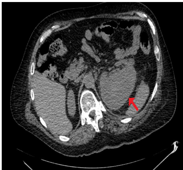
Figure 3 CT of urinary tract.

Note: Performed 4 weeks after the third ureteroscopy, axial section: 9×7 cm subcapsular collection on the left kidney compressing the underlying parenchyma present (arrow).