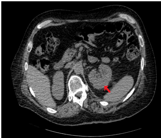
Figure 6 CT of kidneys.

Note: Performed 14 weeks after the third ureteroscopy, axial section, left renal subcapsular collection is much reduced in size, now measuring about 3×2 cm along the outer posterior aspect toward the upper renal pole (arrow).