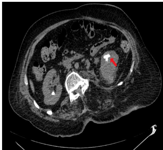
Figure 5 CT of urinary tract.

Note: Performed 4 weeks after the third ureteroscopy, axial section: a few residual stones/fragments are seen in the lower pole calyces largest measuring 19 mm in size (arrow).