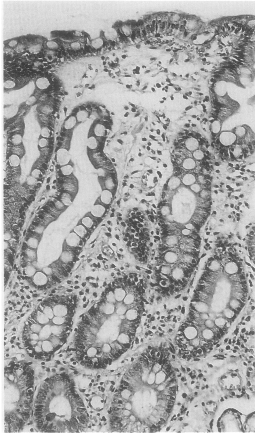
Figure 1 Type I intestinal metaplasia in a patient with fasting bile acid concentration of 1.92 mmol/l and an unoperated stomach.

first to grade biopsy specimens in a manner analogous to that of the new Sydney classification of gastritis, 11 although the two corpus biopsy specimens required for a full classification were not available.