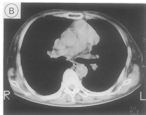
Figure 1B The tumour has almost completely disappeared after treatment

Division of Pathology, Clinical Laboratory, Nagoya University Hospital