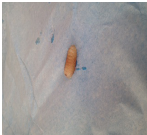
Fig. 2. Cordylobia rodhaini larvae.