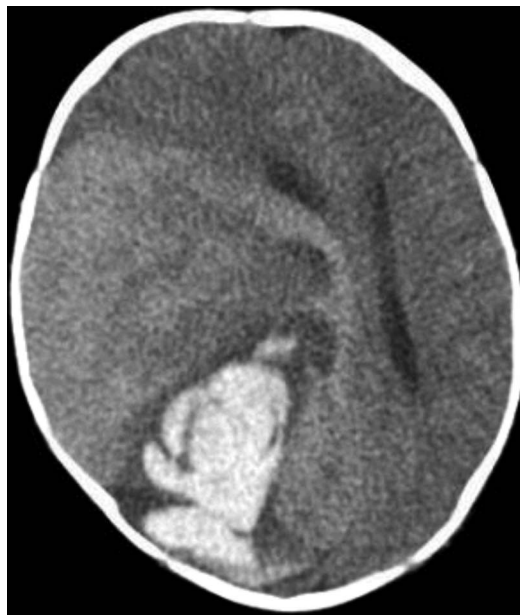
Figure 1 Axial CT image at presentation showing large hyperdense lesion in right cerebral hemisphere with areas of acute haemorrhage, vasogenic oedema and midline shift.

the more prevalent ALK mutation in solid cancers, present in 6% of non-small cell lung cancers. 1 However, ALK fusion proteins have not classically been implicated in primary CNS solid tumours, making this high-grade glioma of infancy a rare and unique case. In conclusion, our findings revealed the first PPP1CB-ALK fusion protein mutation in a primary CNS tumour.