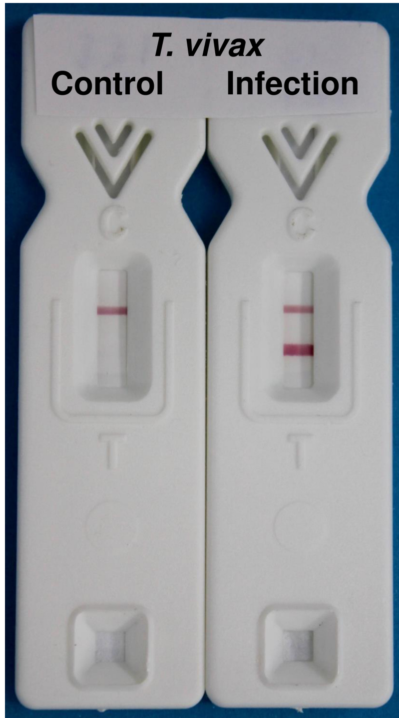
Fig 2. Examples of the TvY486_0045500 prototype lateral flow tests developed with control and infection sera, as indicated. Top band control line, bottom band TvY486_0045500 diagnostic line.