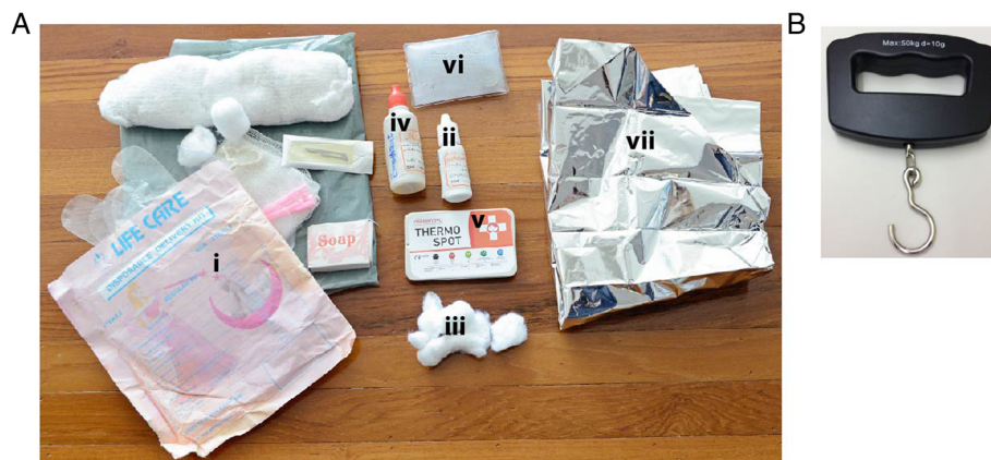
Fig. 3 Integrated neonatal survival kit contents. a The neonatal survival kit includes: i) clean delivery kit, ii) 4 % chlorhexidine solution that is to be applied with iii) cotton balls, iv) sunflower oil emollient, v) ThermoSpot, vi) a reusable instant heat pack, and vii) a Mylar infant blanket. b A handheld battery operated weighing scale will be provided to CHWs in the intervention cluster

All pregnant women who intend to give birth and permanently reside in the trial catchment area for at