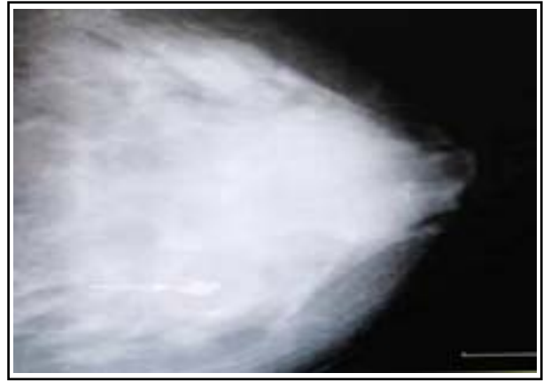
Fig.6: Mammogram shows coarse calcifications in the benign lesion.

Analysis of related evaluation indexes: If BI-RADS grade 4A or higher was taken as the positive standard, the accuracy, sensitivity and specificity of mammography in diagnosing breast cancer were 87.40%, 90.80% and 84.60%; if BI-RADS grade 4B or higher was taken as the positive standard, then the accuracy, sensitivity and specificity of mammography were 89.60%, 85% and 93.30%. The above data were processed by KAPPA consistency test and the results were K = 0.157 ( P = 0.055 ), K = 0.247 ( P = 0.007 ) and K = 71.3\% ( P = 0.000 ). It indicated that, the sensitivity and specificity of mammography in diagnosing breast lump were