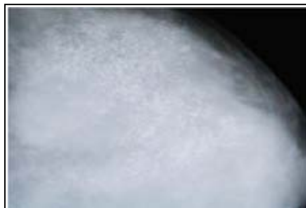
Fig.4: Mammogram shows granular microcalcifications in the malignant lesion.