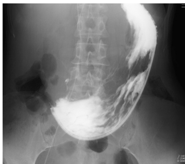
Fig. 2. Photofluorography revealing antrum-pylorus narrowing caused by cancer as well as a large amount of residual food in the stomach.