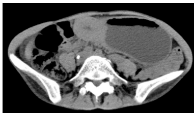
Fig. 3. Abdominal CT revealing wall thickening of the antrum of stomach. No lymph node or distant metastases are evident.