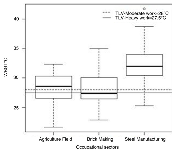
Fig. 1. Distribution of WBGT measurements in 312 female workers in brick manufacturing, steel industry, and agricultural fields (2014–2015).

apparent that about 71% ( n=222 ) of the workers had WBGT exposures higher than the recommended threshold limit value (TLV) as per ACGIH guidelines (40). Forty-two percent of the workers' self-reported perceptions were that high-heat exposures throughout the year was not an uncommon phenomena in their workplace, with significantly higher heat exposures during summer season. Heat exposures in various work categories show the percentage of workers working above and below the safe TLV limits in the study population (Fig. 2).