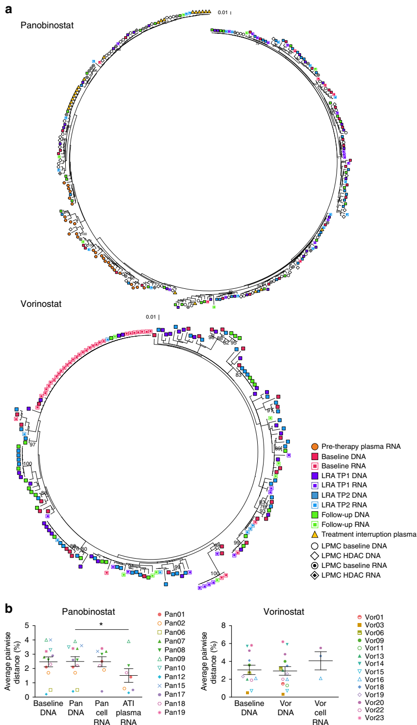
Figure 1 | Panobinostat and vorinostat non-selectively activate transcription from latent HIV-1 proviruses. (a) Representative phylogenetic trees of HIV-1 sequences from HIV-infected participants on suppressive ART who received panobinostat (Pan18) or vorinostat (Vor16) showing the genetic relationship of sequences from each time point. For participant Pan18, the plasma samples were collected ~1 year and 6 months before initiation of antiretroviral therapy and 14 days following the analytical treatment interruption. Peripheral blood samples were collected at baseline, 2 h after the first dose of panobinostat (TP1), 32 days after the first dose of panobinostat (TP2) and 38 days after the final panobinostat dose. Intestinal lamina propria mononuclear cells were collected at baseline (1 week before the first panobinostat dose) and during week 4 of the panobinostat trial. For participant Vor16, peripheral blood samples were collected at baseline, 7 days after the first dose of vorinostat (TP1), 14 days after the first dose of vorinostat (TP2) and 7 days after the final vorinostat dose. (b) Average pairwise distance of cell-associated DNA (Pan n=12 , Vor n=12 ) before and DNA (Pan n=12 , Vor n=14 ) and cell-associated RNA (Pan n=8 , Vor n=3 ) during vorinostat and panobinostat administration, as well as the plasma HIV-1 RNA following an ATI for the panobinostat trial ( n=7 ). Each data point represents the group mean \pm s.e.m. The Wilcoxon signed rank test was used to generate the P values. * P \leq 0.05 .