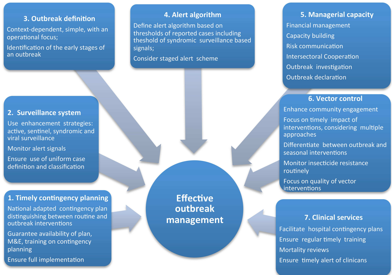
Fig 2. Conceptual framework of dengue contingency planning.