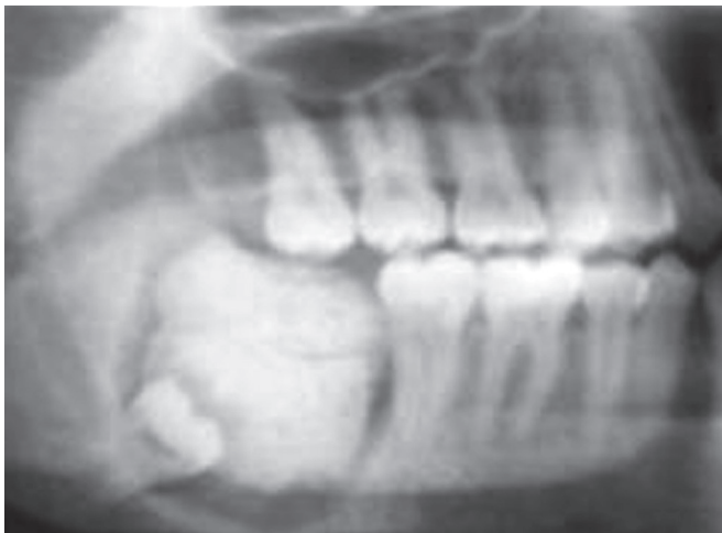
Fig. 3: Radiograph of complex odontome