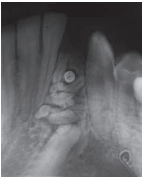
Fig. 2: Radiograph of compound odontome