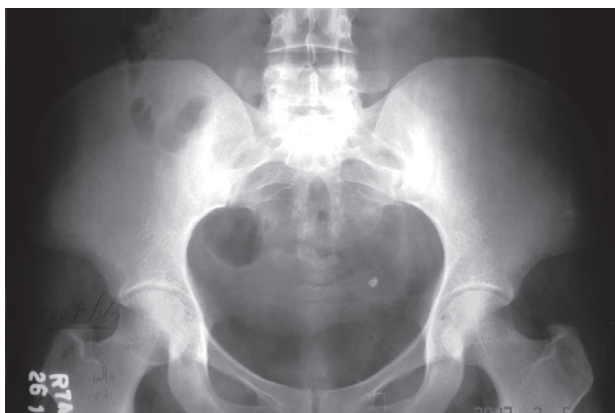
Fig. 1 : Radiograph of the pelvis in antero-posterior projection