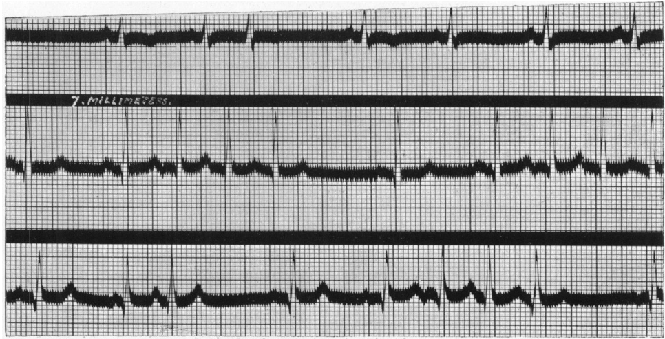
FIG. 1.—Electrocardiogram showing short paroxysms of supra-ventricular extrasystoles and some change of pace-maker shown in lead III.

midclavicular line ; the heart did not appear to be enlarged on percussion, no thrill could be felt, and no murmur was audible, but the action was quite irregular and seemed somewhat faster than at the periphery, presumably because some of the contractions were not powerful enough to reach the radial pulse. The blood pressure was 120/70, the average pulse rate 85. A cardiogram taken on 19/6/1944 (Fig. 1) showed paroxysms of extrasystoles of auricular origin, the latter following each other in such quick succession that their P waves were mostly