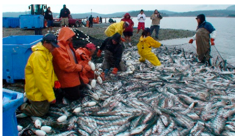
Figure 1. Image of Swinomish “community connection”—beach seiners pulling in a net with salmon.

Workshop discussions took place during a three-hour period, including a lunch of traditional foods. Questions were projected in PowerPoint, with TurningPoint® polling software used to collect and display results. The polling software allowed answers to be tallied and recorded immediately via wireless, hand-held polling devices; simple statistics collated and visually depicted answers in the PowerPoint presentation (e.g., bar graph) while allowing individual responses to remain anonymous in a room full of familiar faces. Throughout the workshop, each of the six indicators was paired with a photograph depicting a common sight at Swinomish in order to provide a visual aid in describing the indicator and as a reminder of the indicator’s meaning. As one example, Figure 1 shows the photograph for “community connection;” the image depicts community members working together to haul in a net while beach seining salmon.