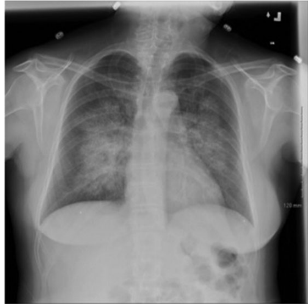
Fig. 2. Chest plain film x-ray during admission in 2014 revealed extensive perihilar opacities.

treated with plasmapheresis three times per week for seven occurrences, oral prednisone 60 mg daily for 6 months and cyclophosphamide 2 mg/kg/day for 6 months.