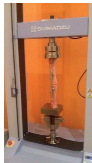
Figure 2. Mitković internal fixator testing of veal bone at Shimadzu Ags-X testing machine

We set up on models of juvidur and veal bones trialed osteosynthesis material; DCP without locking and LCP locking plate with 10 holes. The plates are juvidur or veal bone fastened with three screws on each side "of the fracture crack", making a total of six screws on the board. LIN length of 200 mm is set in the "medullary cavity" model of juvidur, as well as the medullary cavity of veal bones with one screw placed distally and proximally. The same technique was appointed to MIF on juvidur and veal bone models (Figure 2). In order to more accurately position and strengthen the model on the testing machine, were created for this occasion, special grips for proximal and distal part of the model juvidur and veal bones. Static tests