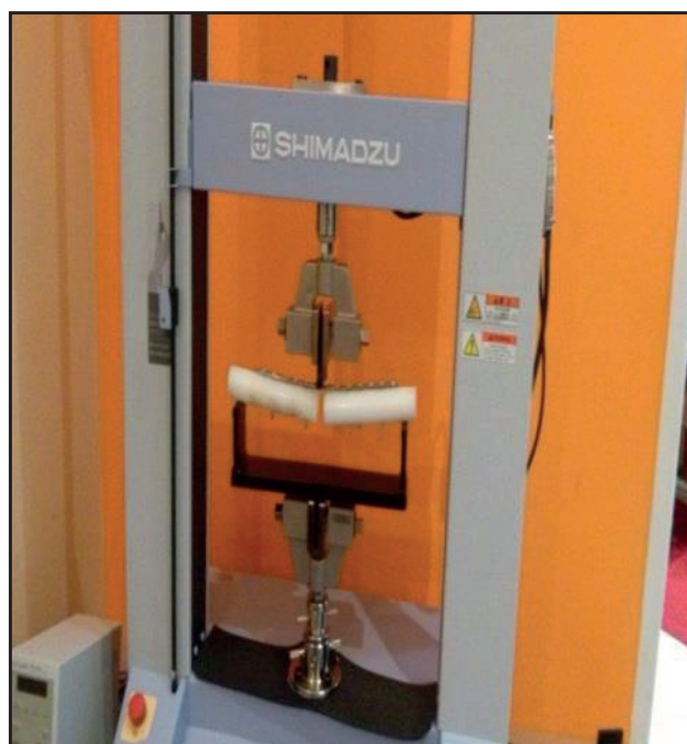
Figure 1. Testing on a Shimadzu Ags-X testing machine of DCP models of juvidur to lateral forces

For the experimental study were used geometrically identical, anatomically shaped models of Juvitur diameter of 30 mm, length 100 mm. "Bone" is represented by two juvidurs with a gap of 10 mm between them, which are stabilized with