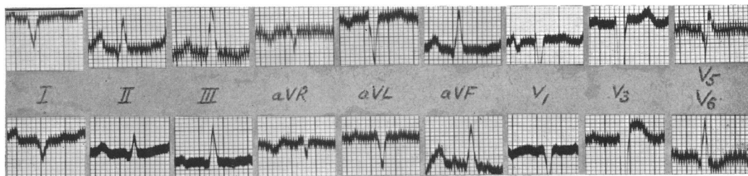
FIG. 1.—(A) Electrocardiogram on 21/8/51 showing evidence of the anterolateral infarction. (B) Record on 4/10/51 showing evidence of further myocardial infarction.

12,500 units intra-muscularly produced clotting times of 22 and 32 minutes, 4 and 8 hours respectively after the injection. Thereafter, for seven days, the clotting times were easily maintained between 18 and 56 minutes by daily doses not exceeding 25,000 units. In spite of this, another myocardial infarction occurred on 4/10/51; the electrocardiogram was confirmatory, showing S-T shift in V3 and further prolongation of the P-R interval (Fig. 1B).