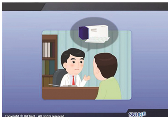
Figure 2 The decision aid developed and used in the present study.

motivation, and self-efficacy for smoking cessation (10-point Likert scale, each) were enquired with each single-item rating scale, which are commonly used forms for studies of