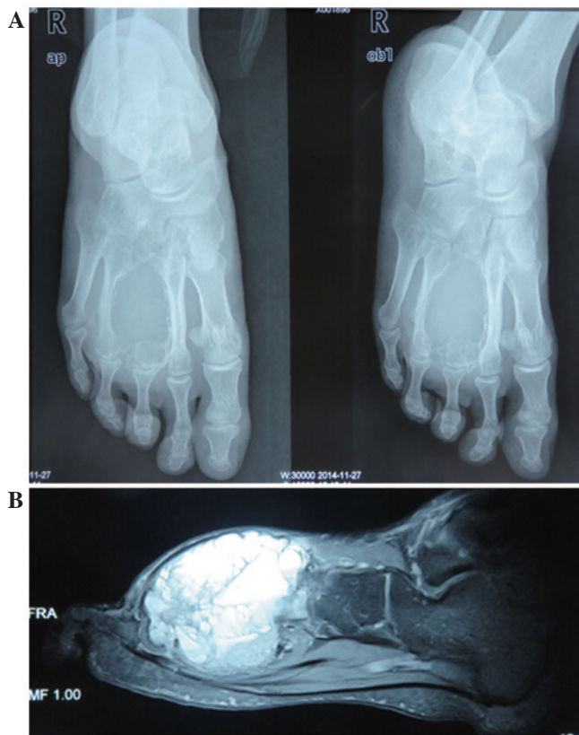
Figure 1. (A) Radiograph showing a lytic lesion in the entire third metatarsal, leaving the cortex as a thin shell with a 'finger in a balloon' appearance. (B) T2-weighted magnetic resonance imaging sequence showing deformity of the involved metatarsal bone with fluid-fluid levels.