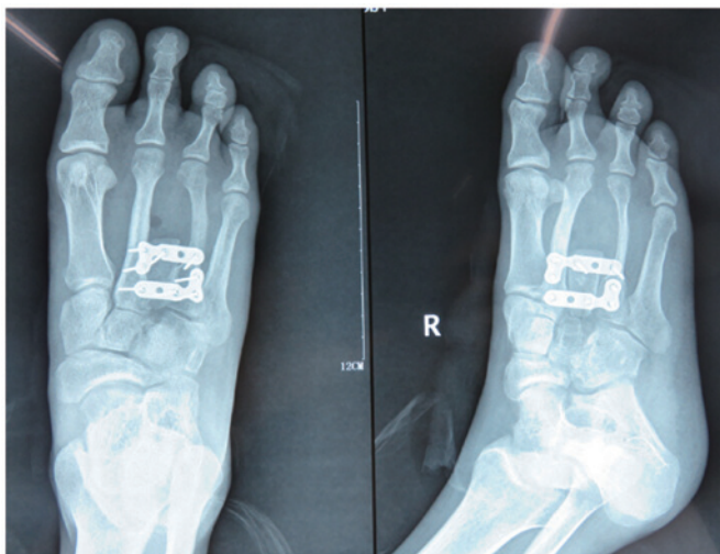
Figure 2. Intraoperative radiographs of the lesion following repair and stabilization using double-plate fixation.

corresponding to osteoprogenitor cells that were detected by hematoxylin-eosin staining), fibrous connective tissue and multinucleated giant cell proliferation, with reactive hyperplasia and trabecular bone tissue (Fig. 3). A final diagnosis of ABC was established based on the collective clinical information. The treatment was successful, as no further treatment was required during subsequent follow-ups and the patient remains healthy at present.