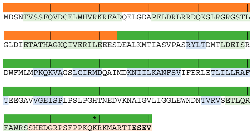
Figure 1. Predicted amino acid sequence of equine influenza strain A/equine/Uruguay/63 (H3N8) (GenBank accession number: CY032425). The N-terminal RNA-binding domain (residues 1–73) and C-terminal “effector” domain (residues 74–230) are indicated by the shaded bars above the amino acid sequence (red and green, respectively), with vertical lines marking every tenth amino acid. The green and blue text shading indicates the alpha and beta helices, respectively. The asterisk marks the position of the 11-amino-acid truncation seen in many recent equine influenza H3N8 isolates and the PDZ-binding domain (ESEV) is indicated in bold text.