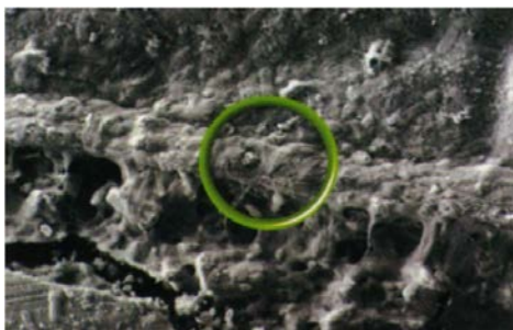
Figure 1. Interfacial ion-exchange layer formed between tooth surface (above) and glass-ionomer cement (below). The circle indicates part of the ion-exchange layer.

Adhesion is important because it aids the retention of glass-ionomer cements within the tooth and also reduces or eliminates marginal leakage. This means that harmful micro-organisms are unable to enter the space under the restoration to promote decay.