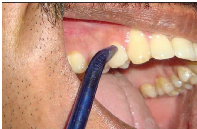
Figure 2: Irrigation device while delivering irrigating solution at gingival margin