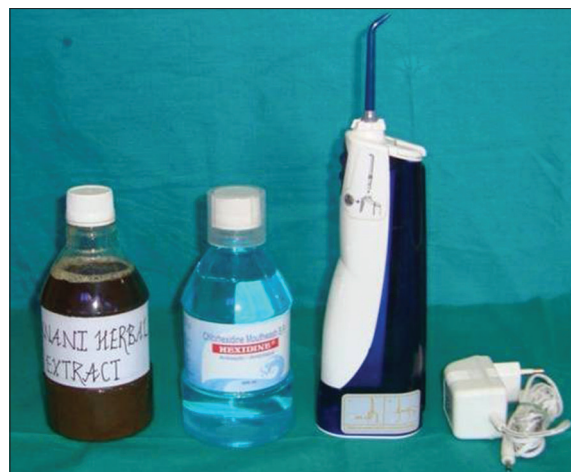
Figure 3: Irrigating solutions (herbal extract, chlorhexidine) with irrigating device

The successful long-term management of periodontitis requires a proper maintenance of the results obtained after treatment. [17] This can be successfully done with the adjunctive use of antimicrobials. [18] Subgingival irrigation with