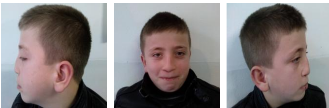
Figure 3: Saddle nose (rhinolordosis) due to untreated septal hematoma after the nasal trauma in early childhood (with the permission of parents)

Actual indications are severe congenital malformations of the nose, recent traumatic deformities, external distortion of the nose due to septal abscess, breathing problems due to septum pathology, cleft lip nose, dermoid cysts.