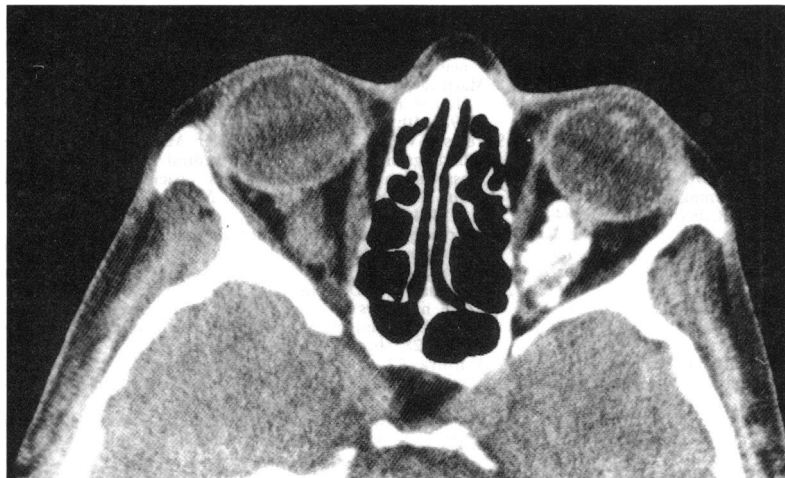
Figure 2 CT scan showing thickened calcified left optic nerve tumour and thickened irregular right optic nerve.

abduction, and adduction of the left eye. There was bilateral gaze-evoked nystagmus. Corneal sensation was reduced on the right but normal on the left. The lenses were clear, and intraocular pressures were normal. Both pupils reacted to light, and there was no relative afferent pupillary defect.