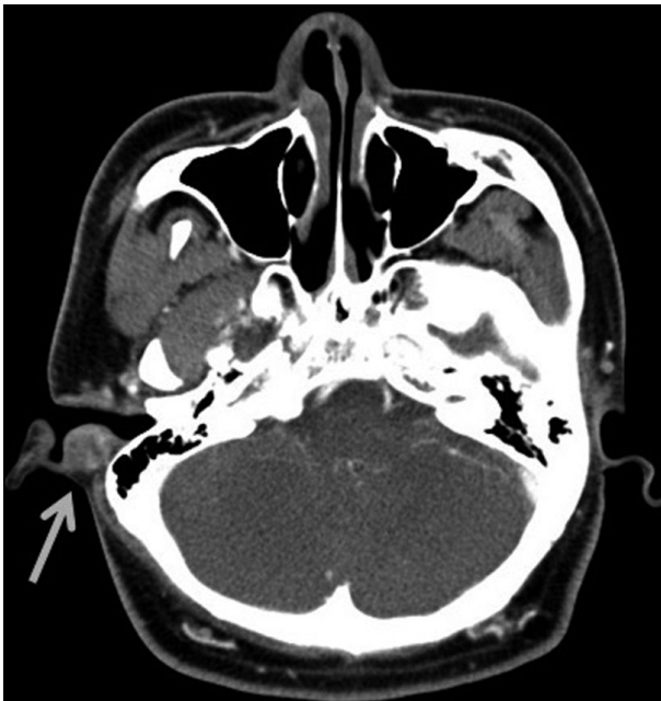
Fig. 1. Radiologic finding. An ovoid mass with soft tissue density (arrow) is noted in the right external auditory canal on computed tomography.

Thompson et al. 3 reported the largest number of cases of auricular nodular fasciitis. They described 50 cases of auricular nodular fasciitis and its clinicopathologic characteristics. In their 50 cases, 37 cases (74%) were located in preauricular and postauricular region. Six cases (12%) were located in external auditory canal. Auricular nodular fasciitis accounted for 1.5% of all 3,930 cases of nodular fasciitis in all anatomical sites and for 1.9% of all 2,930 cases of benign and malignant auricular neoplasms and soft tissue reactive condition identified from 1970 to 1990 at their institution. Auricular nodular fasciitis