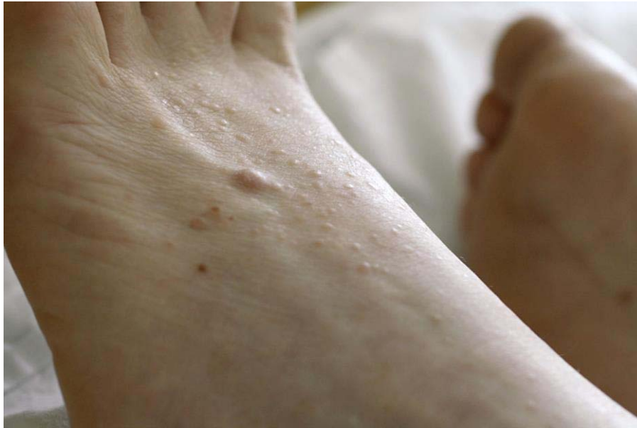
Fig. 2. Lichen nitidus-like lesions. Grouped, lichenoid, glossy papules close to a histologically proven histiocytoma on the left forefoot.