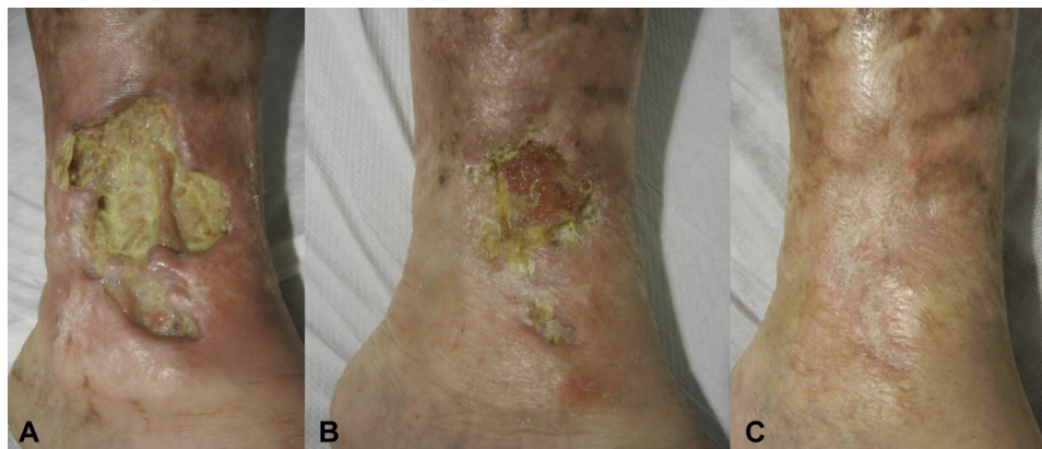
Fig 1. Evolution of the ulcer in inner left lower leg. A , Before treatment. B , Two weeks after the last doses of canakinumab. C , 6 months after the beginning of treatment.