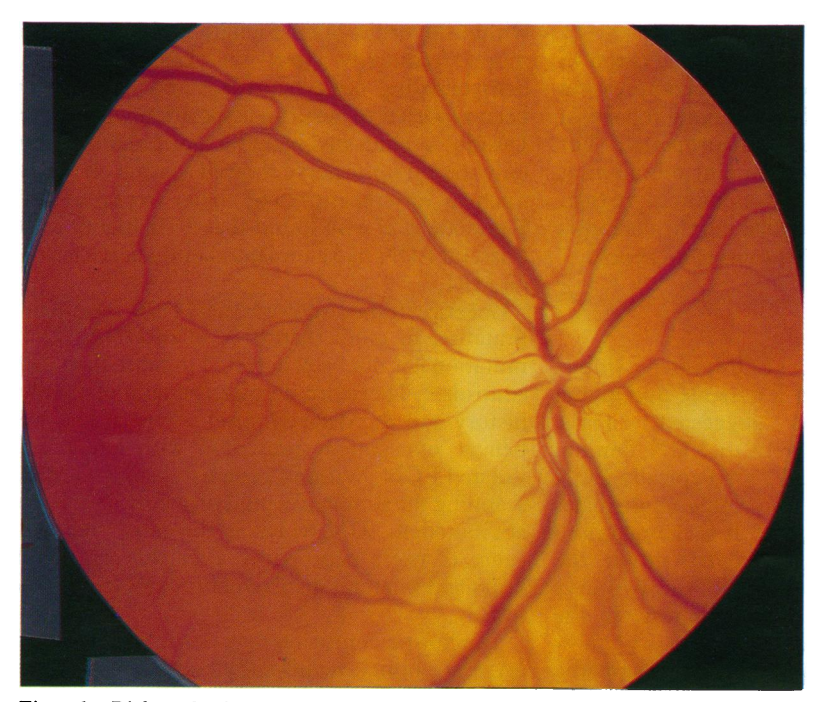
Figure 1 Right ocular fundus showing a normal sized disc without a cup with visible inferotemporal peripapillary capillaries. Medullated nerve fibres are seen nasally.

Central visual loss in one eye followed within a year by central visual loss in the fellow eye can present diagnostic difficulties in patients with a normal fundus examination. Exclusion of compression, infiltration, and a negative family history may lead to the diagnosis of ischaemic optic neuropathy (ION) in the elderly patient. In view of the therapeutic options an accurate diagnosis is important. We report the case of a 63-year-old patient without any family history of visual loss who presented with sequential bilateral optic neuropathy and a mitochondrial DNA mutation associated with Leber's optic neuropathy (LON). The diagnosis was supported by magnetic resonance imaging (MRI) and electrophysiological findings.