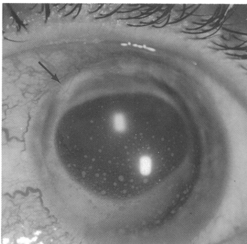
Figure 1 Anterior chamber photograph of patient No 3 showing granulomatous keratic precipitates, capsular thickening, and abscess superiorly, indicated by the arrow. This was the best appearance after prolonged topical treatment with steroids and antibiotics. Other eyes showed severe corneal oedema, hypopyon uveitis, and pupillary membranes.

A 50-year-old man with retinitis pigmentosa underwent uncomplicated left extracapsular cataract extraction and lens implant (11 March 1991). Two months postoperatively he presented with uveitis and hypopyon and marked decrease in visual acuity (from 6/12 to hand movements). Right cataract surgery was performed uneventfully 4 months after the left. Tertiary referral was