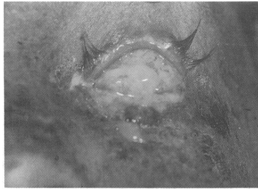
Figure 1 Xeroderma pigmentosum case with extensive growth of epibulbar squamous cell carcinoma eroding the cornea, conjunctiva, and the lower lid.