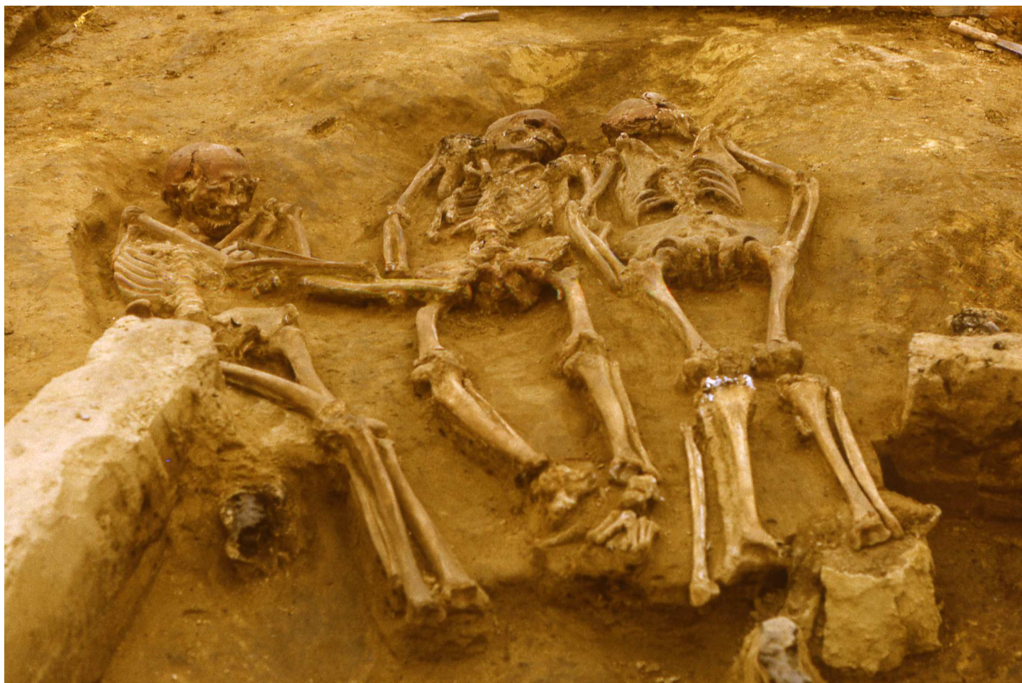
Fig 1. The triple burial of Dolní Věstonice, Moravia, dated to around 31,000 years before present. From left to right: DV 13, DV 15, DV 14.