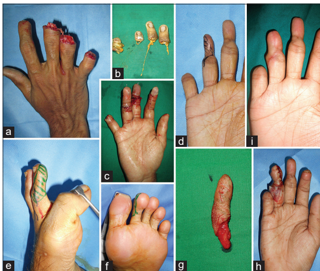
Figure 4: (a) Crush amputation right index through little finger. (b) Amputated parts showing avulsion elements. (c) The digits after replantation. (d) Arterial insufficiency marked on ring finger. (e and f) Second toe pulp flap markings. (g) Elevated flap. (h) The flap after inset, proximal part covered with a small split thickness graft. (i) 5 months post-operative result showing improved aesthesia