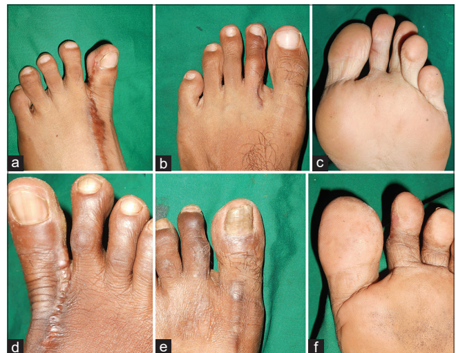
Figure 7: (a) Donor big toe after 10 months post-operatively, showing well settled big toe scar with hypertrophic scar on the dorsum. (b and c) Well settled donor in case of second toe pulp flap after 7 months post-operatively with negligible scar. Since the dissection stopped at the web space there is no donor scar in the dorsum foot. (d) Well settled great toe 11 months post-operative with ugly scar on the dorsum foot due to proximal dissection. (e and f) Very good donor site, 6 months post-operatively in case of second toe pulp flap