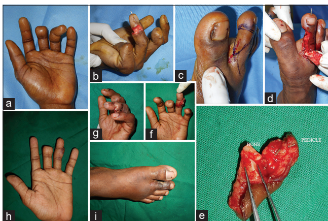
Figure 6: (a) Post-traumatic malunited left ring finger with ulnar deviation. (b) Defect over the medial and the volar ring finger post-release. (c) Second toe pulp flap marking. (d and e) Flap harvesting showing a small piece of bone taken as composite flap from the middle phalanx. (f and g) Flap inset immediate post-operative. (h) Well settled flap 1½ months post-surgery. (i) Well healed donor site

The options for reconstruction vary from local flaps to free tissue transfer in finger pulp and volar defects. The local flaps usually performed for the digital reconstruction are cross finger flap, thenar flap, first dorsal metacarpal artery (FDMA) flap, reverse dorsal metacarpal artery flap and reverse homodigital island flap. The main disadvantages of these flaps are the inferior sensory recovery and the scar over the nearby visible donor area. The use of neurotization in FDMA [7] and cross finger flap [8] improves the sensory recovery, but the donor scar and colour texture match are still poor. Digital artery perforator flap is another option which gives tissue match with donor site scar which is still poor. [9] With the revolutionary changes in microsurgery, the reconstruction is nearing the ideal. The options are free great toe pulp flap, second toe pulp flap, medial plantar artery perforator flap [10] and freestyle perforator flap depending on the defect size.