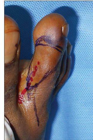
Figure 1: The flap marking- with artery marked red colour and dorsal vein in blue

All the surgeries were performed by a single surgeon including recipient dissection, flap elevation to the anastomosis. Pre-operative handheld Doppler assessment of both the donor and the recipient sites were done, and the arteries marked. The veins were marked over the dorsum of the digit with keeping a venous tourniquet before the surgery [Figure 1]. The procedures were done under regional anaesthesia, axillary and the wrist