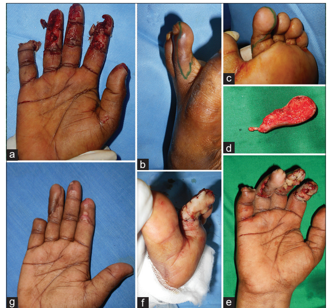
Figure 5: (a) Injury to right index, middle, ring and little finger. Ring finger had exposed tendon, little and index finger had crushed tip and middle finger with superficial volar tissue loss. (b and c) Second toe flap markings. (d) Elevated flap. (e) Toe pulp flap used to cover the ring finger, full thickness graft for the middle finger and primary closure of the little and index finger. (f) Donor site closed with full thickness graft. (g) 4 months post-operative results showing well settled flap