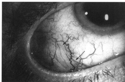
Figure 1 Red, solid conjunctival mass (arrows) with dilated vessels in the inferotemporal bulbar conjunctiva in a patient with metastatic breast carcinoma.

Table 2 summarises the clinical ophthalmic presentation, treatment, and outcome for each patient. The chief complaint was red eye in four, foreign body sensation in two, visible mass in two, pain in one, and tearing in one patient. The visual acuity was 20/40 or better in eight patients. In two patients the acuity was 20/80 and hand movements, respectively due to concurrent iris metastases which produced extensive anterior chamber cells and secondary elevation of intraocular pressure. All 10 patients had unilateral involvement. In two patients (Nos 2 and 3) the conjunctiva was the only site of ocular and adnexal metastases. In three patients the iris was also involved and in four iris and posterior uvea were involved. Ipsilateral