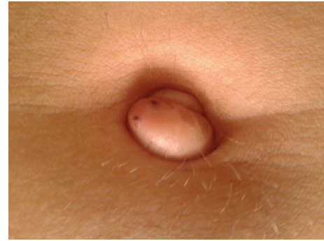
FIGURE 2: Umbilical nodule.

Abdominal examination was otherwise normal with no clinical signs of hernia. The first ultrasonography of the umbilical nodule revealed an image suggestive of dermoid cyst. Pelvic computed tomography (CT) scan revealed two contiguous cystic images with peripheral contrast enhancement in the left adnexal area that were included in the differential diagnosis of endometrioma, tubo-ovarian abscess, and serous cystadenoma. A second ultrasound scan of the lesion revealed two superficial cysts measuring 2 mm and another deeper cyst measuring 4 mm, with nonspecific aspect, though compatible with sebaceous or dermal inclusion cysts. Magnetic resonance imaging (MRI) showed uterus measuring 92 × 40 × 58 mm, with multiple small nodules showing signal hypointensity on T2-weighted imaging regarded as intramural leiomyomas and the presence of some endometrial glands suggesting adenomyosis, endometrium with 6 mm (Figure 3). MRI also revealed a left septated ovarian cyst measuring