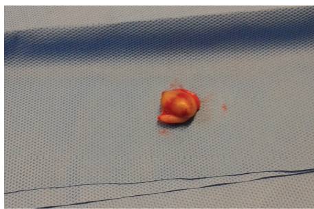
FIGURE 5: Umbilical nodule resected.

structures (the implantation or retrograde menstruation theory) [3]), haematogenous or lymphatic dissemination of endometrial cells (the dissemination theory), ectopic differentiation of pluripotent peritoneal progenitor cells to endometrial tissue (coelomic metaplasia theory) [3, 24, 25, 30], production of substances to form endometriosis by sloughed endometrium (the induction theory), specific stimulation to a Müllerian origin cell nest producing endometriosis (the embryonic rest theory), and proliferation of ectopic