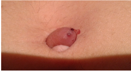
FIGURE 1: Umbilical nodule bleeding during menstrual cycle.

The authors report a case of a patient with umbilical endometriosis associated with a previous laparoscopic intervention and treated by surgical excision.